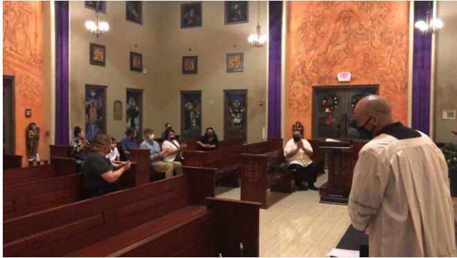
At the first Mass - Advent 4, 2020

In 1898 the United States won Guam in the Spanish-American War; Episcopal and Baptist