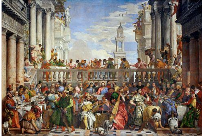
The Wedding Feast at Cana Paolo Veronese 1563