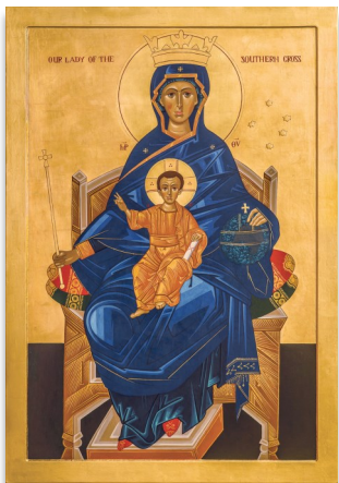
Our Lady of the Southern Cross Help of Christians Pray for us

Electronic transfer details: Parish of St Ninian & St Chad, BSB 086 006 A/C 12492 8556