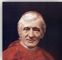
St John Henry Newman Pray for us

The Personal Ordinariate of Our Lady of the Southern Cross